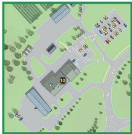
Automotive Programs 141 College Drive, Albemarle, NC 28001