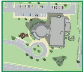
Crutchfield Education Center 102 Stanly Parkway, Locust, NC 28097